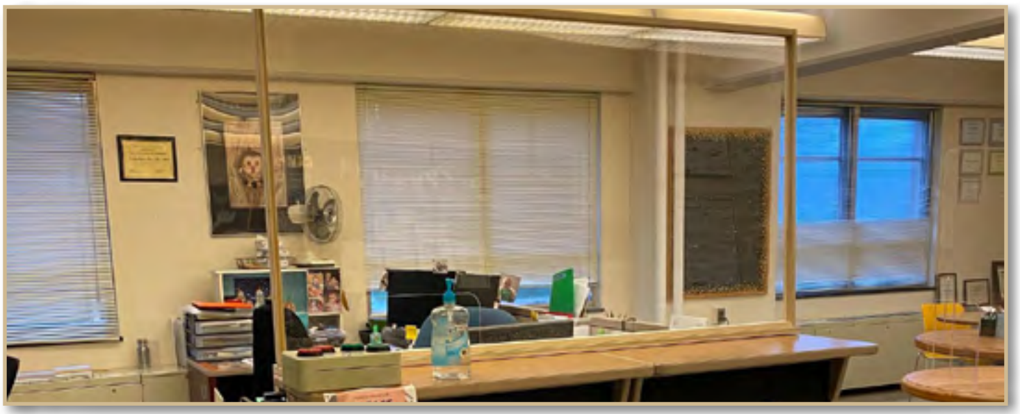
The Writing Lab (pictured here) with plexiglass barriers added on the front desk and session tables.

am the Website and Social Media Director. I help develop communication assets around neglected tropical diseases (NTDs) and advocate for those affected by NTDs. I work with experts in the US, UK, and other nations, and from the World Health Organization. We recently held our virtual 2020 Conference, bringing together 1,000 attendees from 80+ countries. I led the social media efforts, including our social media strategy and content creation.